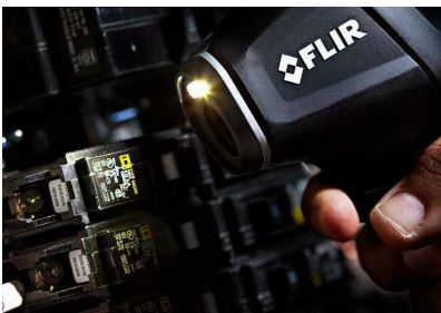
TG54 and TG56 feature powerful LED worklights