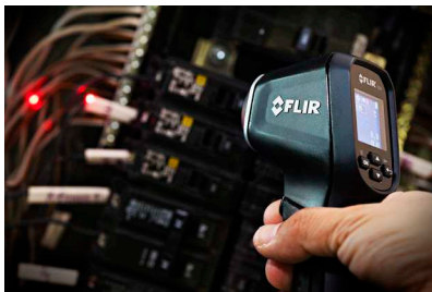
Easily identify measurement location with built-in laser